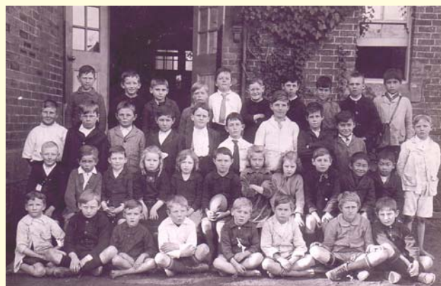
2 nd & 3 rd class, North Ryde PS, 1923

The museum is open for pre-booked school excursions on Mondays and Wednesdays. Students experience early school lessons, examine a range of objects and artefacts and do outdoor activities such as games, drill and maypole dancing.